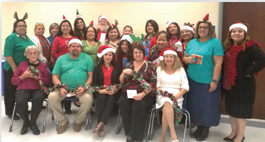
December 14, 2018: VESA members present at the December Meeting/Social.