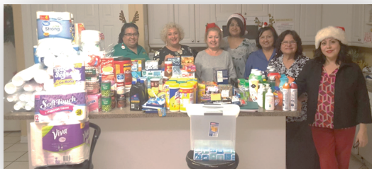
December 19, 2018: VESA Members who delivered donations to the Aurora House in Weslaco, TX.