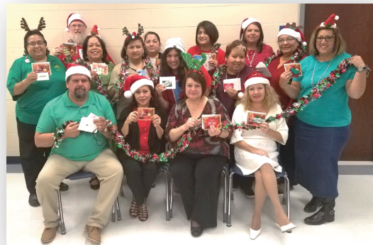
December 14, 2018: VESA members who qualified for Attendance Incentive Gift Cards