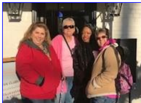
Members of the Brazos Valley and Killeen affiliates meet in Waco, Texas for a fun day at the Magnolia Silos.

BVESA is planning more growing thoughts in the coming months. Come grow with us!