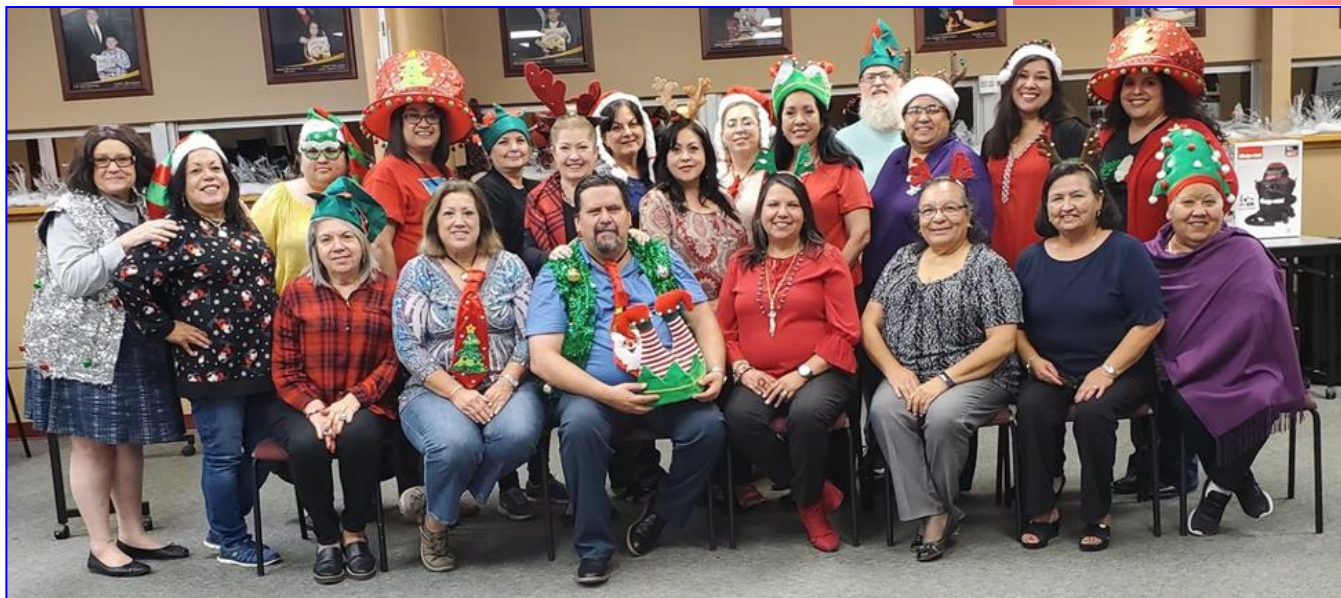
Members of the Rio Grande Valley Educational Support Staff Association present at the December 5 Meeting and Holiday Social.