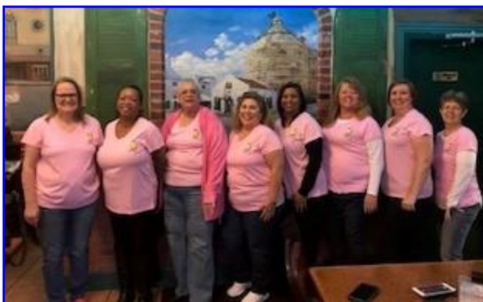
KESA members met members of the Brazos Valley Educational Support Staff Association for a day of shopping and fun in Waco.

We have boxes at different locations in KISD and a church in Killeen is also participating in our drive.