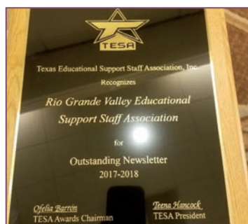
Outstanding Newsletter Plaque awards to VESA