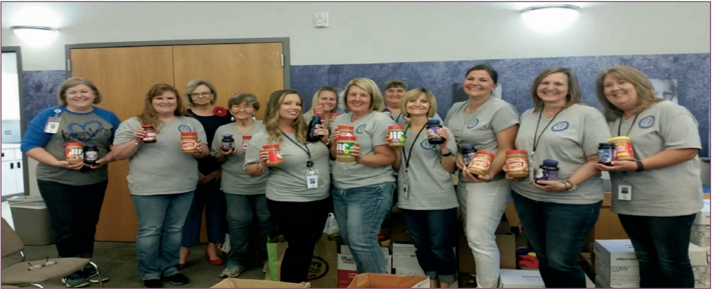
WESA Members showing off their Spring Project collection.