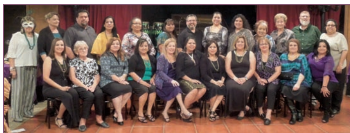
VESA Members in attendance at the 51st Annual VESA Bosses Banquet.

VESA submitted their Newsletter for competition this year and we are proud to say that we took first place! What a way to end the year!!!