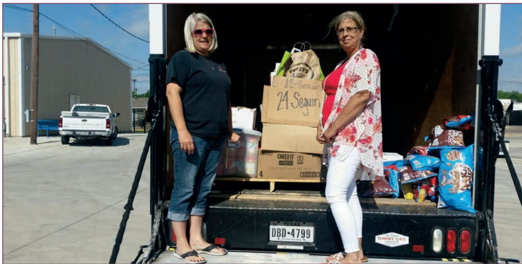
Center of Hope Representatives picking up peanut butter and jelly donation.