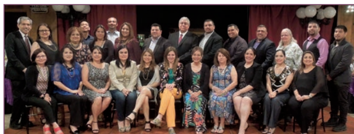
VESA Bosses in attendance at the 51st Annual VESA Bosses Banquet.